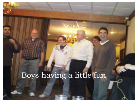
Boys having a little fun