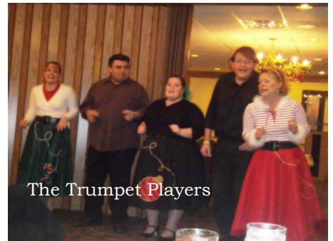
The Trumpet Players