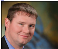
Our 1st Guest Speaker is:

We have two Speakers for our January 12th General Meeting.